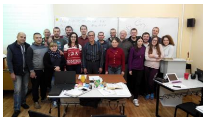
November class on Biblical Counseling at KTS