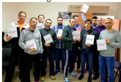
Ukrainian Baptist Seminary church-planters glad to receive book, Center Church by Tim Keller.

This ministry began with a discount book ministry for the students that has grown to a “bookstore” with over 120 titles. Hundreds of books have been purchased this year for personal or church libraries. Two years ago, we began a partnership with the Gospel Coalition (called “Theological Famine Relief”) and regularly distribute their books (free of charge) to students and pastors (see picture above). We also continue to supply churches in Ukraine with Gospel tracts (“The Story” and “Two Ways to Live”) that we print in partnership with Christian publisher, InLumine (located in Chernigov). By God’s grace more than 75,000 tracts have been distributed so far.